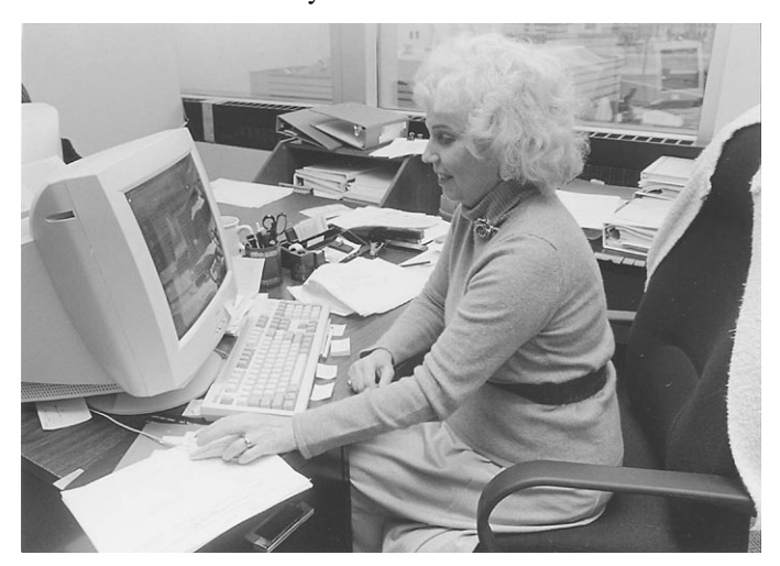
A bachelor's degree in engineering is required for most entrylevel jobs.

Education and training. A bachelor's degree in engineering is required for almost all entry-level engineering jobs. College graduates with a degree in a natural science or mathematics occasionally may qualify for some engineering jobs, especially in specialties in high demand. Most engineering degrees are granted in electrical, electronics, mechanical, or civil engineering. However, engineers trained in one branch may work in related branches. For example, many aerospace engineers have training in mechanical engineering. This flexibility allows employers to meet staffing needs in new technologies and specialties in which engineers may be in short supply. It also allows engineers to shift to fields with better employment prospects or to those that more closely match their interests.