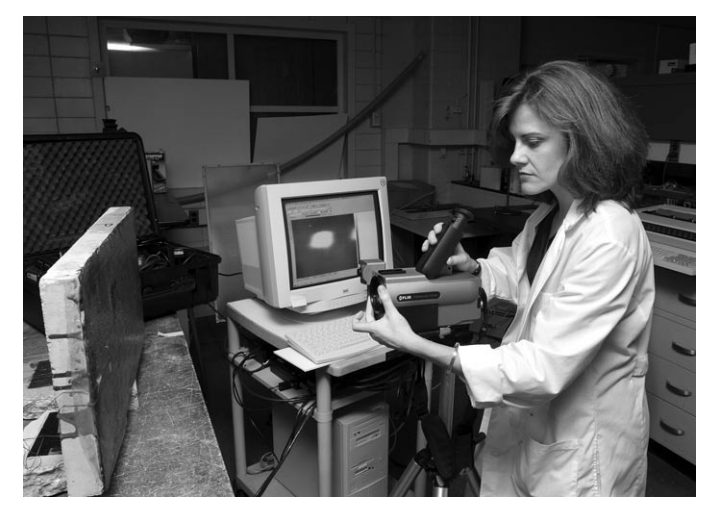
Engineers sometimes perform tests in laboratories.

•Biomedical engineers develop devices and procedures that solve medical and health-related problems by combining their knowledge of biology and medicine with engineering principles and practices. Many do research, along with life scientists, chemists, and medical scientists, to develop and evaluate systems and products such as artificial organs, prostheses (artificial devices that replace missing body parts), instrumentation, medical information systems, and health management and care delivery systems. Biomedical engineers may also design devices used in various medical procedures, imaging systems