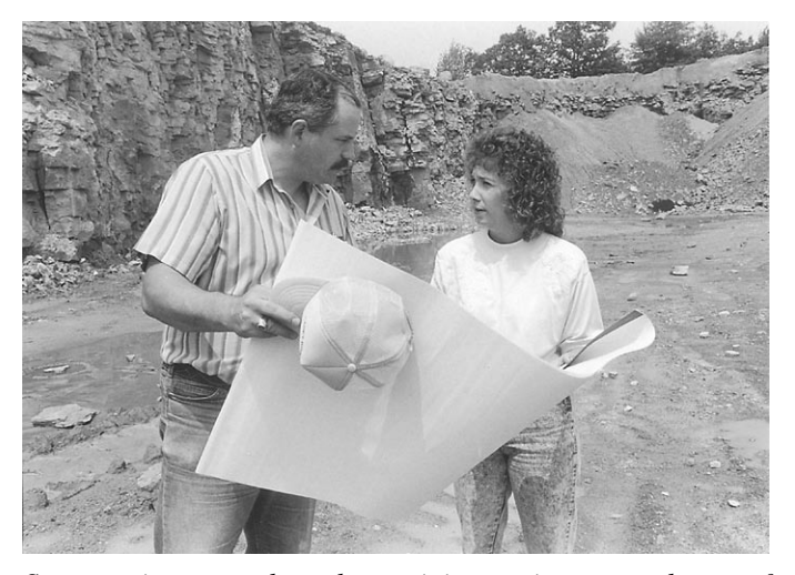
Some engineers, such as these mining engineers, work part of their time outdoors.

• Mechanical engineers research, design, develop, manufacture, and test tools, engines, machines, and other mechanical devices. Mechanical engineering is one of the broadest engineering disciplines. Engineers in this discipline work on power-producing machines such as electric generators, internal combustion engines, and steam and gas turbines. They also work on power-using machines such as refrigeration and airconditioning equipment, machine tools, material handling systems, elevators and escalators, industrial production equipment, and robots used in manufacturing. Mechanical engineers also design tools that other engineers need for their work. In addition, mechanical engineers work in manufacturing or agriculture production, maintenance, or technical sales; many become administrators or managers.